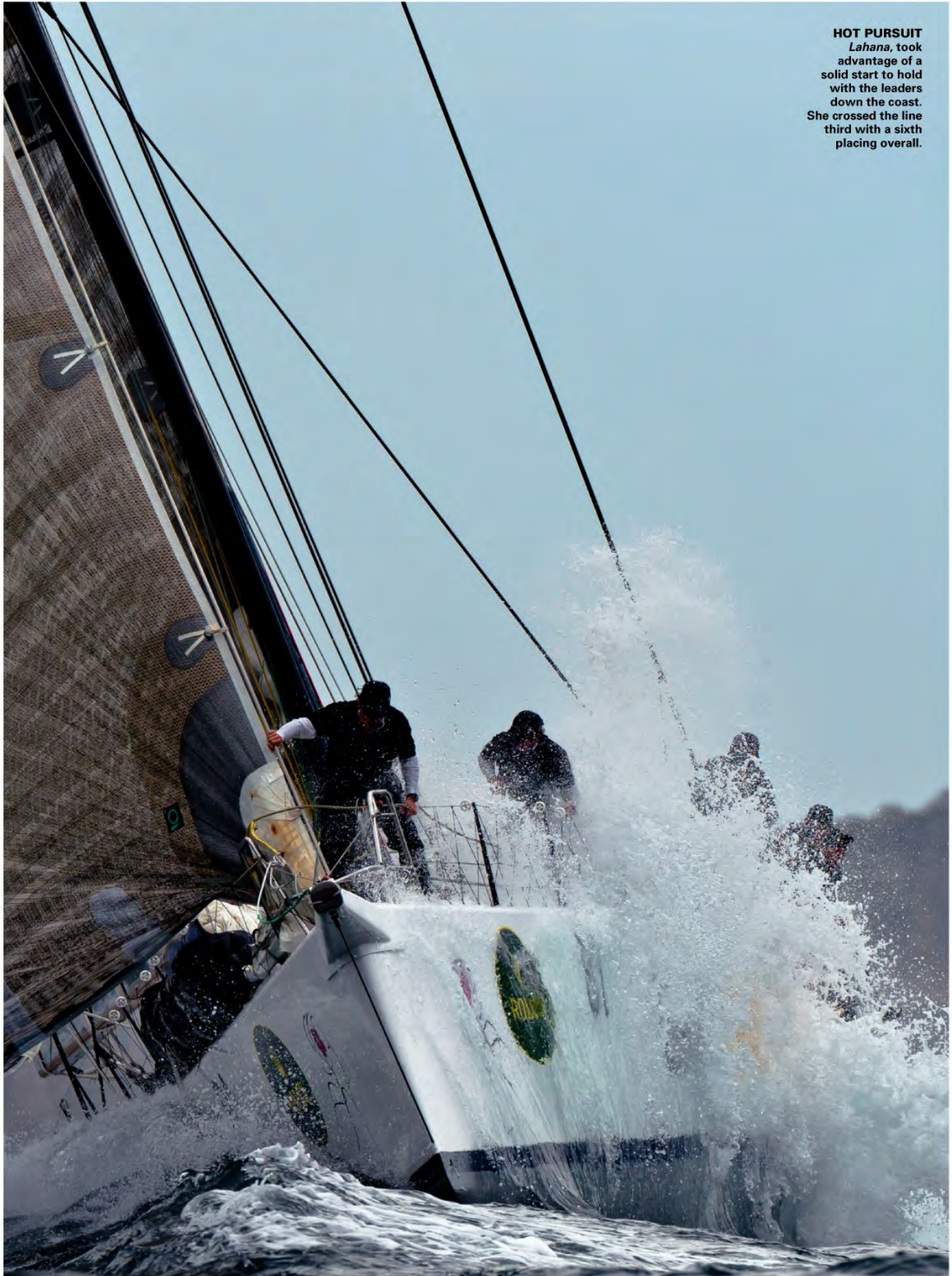
HOT PURSUIT Lahana , took advantage of a solid start to hold with the leaders down the coast. She crossed the line third with a sixth placing overall.