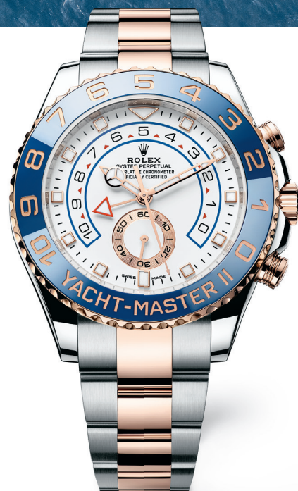
OYSTER PERPETUAL YACHT-MASTER II